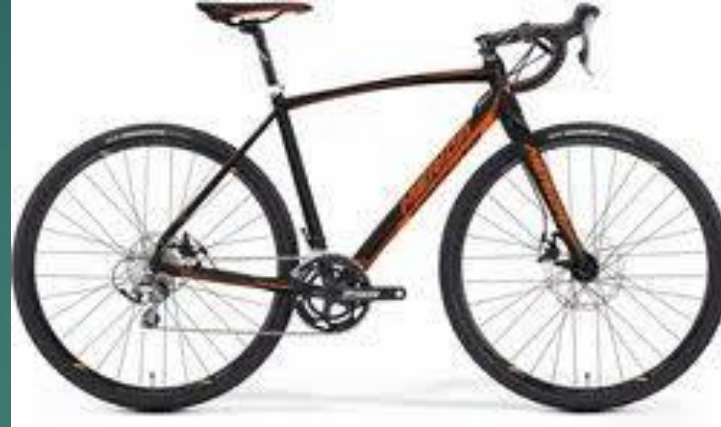
Merida Cyclocross 300